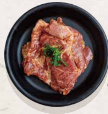
Marinated Pork Ribs 양념돼지갈비 | 300g 28

*Side dishes may vary according to seasonal availability.