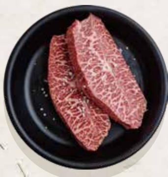
Wagyu Oyster Blade 와규낙엽살 | 150g 37