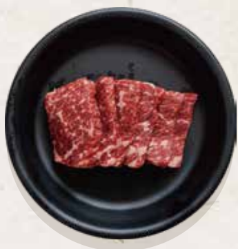
Wagyu Chuck Tail Flap 와규살치살 | 150g 37