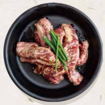
Marinated Wagyu Rib Finger 양념갈비살 | 250g 32