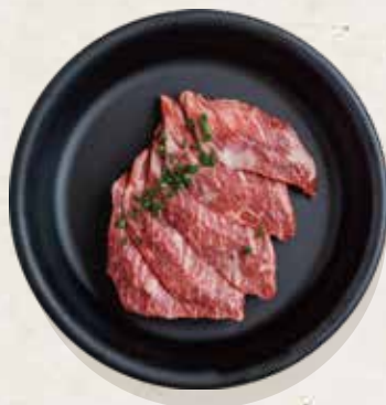
Wagyu Deckle 와규본갈비살 | 150g 36