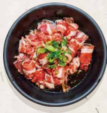
Sliced Pork Bulgogi [ Soy / Spicy ] 숯불돼지불고기 | 250g 25