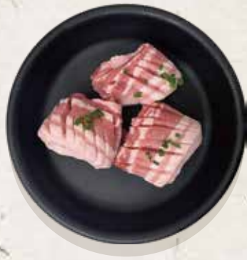
Pork Belly 삼겹살 | 250g 27

Minimum 2 orders from any meats Side dishes are served once with BBQ orders.