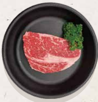
Wagyu Cube Roll 와규꽃등심 | 200g 49