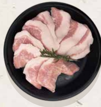
Pork Jowl 향정살 | 250g 27