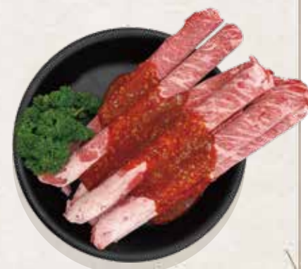
Sliced Chuck Eye Roll [ Soy / Spicy ] 숯불와규불고기 | 200g 29